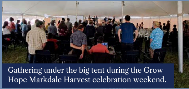
Gathering under the big tent during the Grow Hope Markdale Harvest celebration weekend.