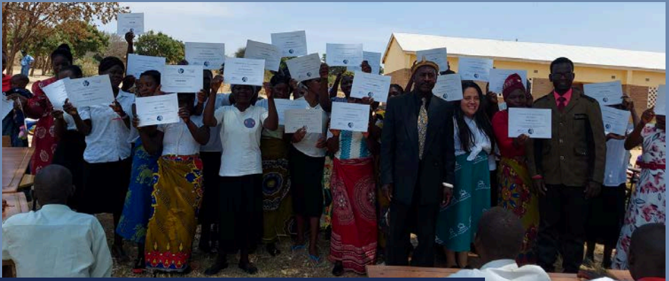
NCM Canada staff presented Certificates of Completion to the women who completed training in Tailoring and Sewing.