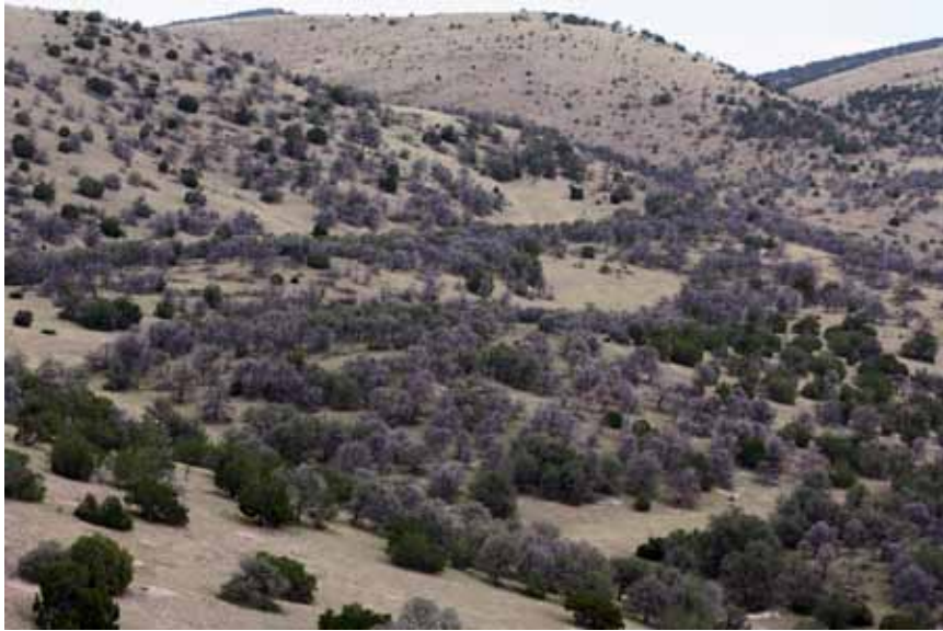
Figure 8. A forest of dead and dying trees in the American Southwest.

Alaska has suffered the death of millions of acres of trees. Pests, which used to be killed by cold weather, now live longer, grow faster and eat more than they used to. Increased problems with pests and fires could cause a loss of 50 percent of the harvestable timber in Alaska, at an estimated cost of $332 million. 52