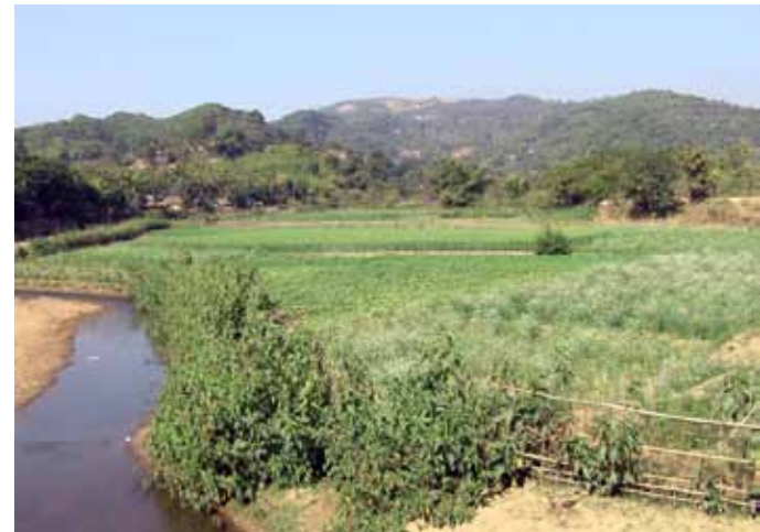
Figure 11. Erosion on this Bangladeshi river has caused 400 families to lose their land over a period of years.

The poor, especially in poor nations, are the most vulnerable to abrupt changes in the environment. 79-80,34 In one study on the effect of climate unpredictability, researchers found that in 16 poor nations, poor people will become more vulnerable if climate continues to change, because they have no buffer to help them deal with crop failures or other sudden changes. 81 Similarly, poor people are less likely to have flood or other disaster insurance or to be able to manage in the case of disasters.