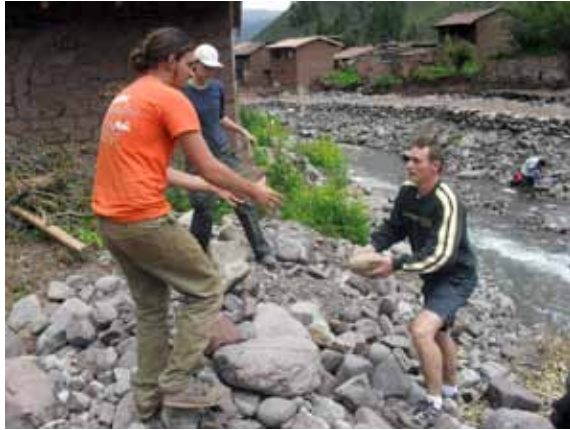
Figure 12. Goshen College students help rebuild after extreme storms hit Peru.

Machu Picchu, sacred city of the Incas and the most visited tourist destination in South America. Many foreign tourists cancelled trips, which resulted in millions of dollars in lost tourist revenues to the region.