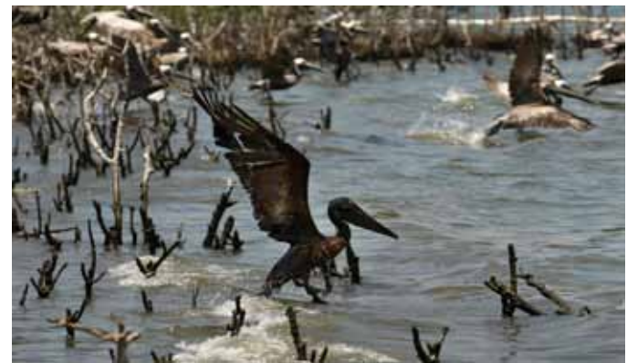
Figure 1. Images of the aftereffects of a huge oil spill from the Deepwater Horizon oil well in the Gulf of Mexico shocked many people and prompted a new look at the role Christians play in caring for the environment and those affected by the disaster.

Although the oil spill was not related to climate change, it was eye opening for American Christians. Devastated coastal communities seen alongside a damaged environment helped us connect the ideas of care of our neighbors and care of creation in a new way. Some in the evangelical community spoke out with renewed vigor on the importance of caring for the world God has entrusted to us. For example, the Southern Baptist Convention passed a resolution on the disaster in the Gulf, calling on Christians to recognize the responsibility to care for the environment for future generations. 1