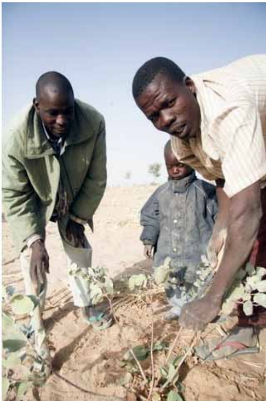
Figure 3. Nigerians tend a tree planted to stabilize soils as part of a reforestation project. Many Christian organizations already include creation care, including climate-change adaptation, as a part of their work.

Sharing our faith with the world and seeing its people come to know Christ are integral parts of the Christian life. Many evangelicals support relief and development work, because they want to live out the command to care for the poor. We live out the gospel by meeting the poor and vulnerable where they are, showing them the love of Christ as we address their basic needs and point them to salvation in Christ.