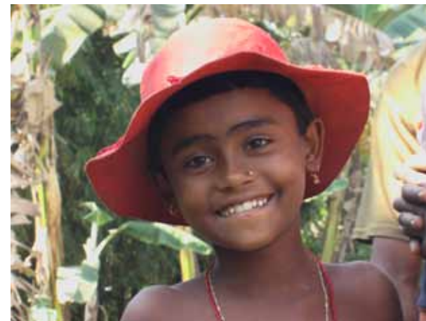
Figure 13. This young Bangladeshi girl struggles with the difficulties that come from poverty and climate change.

Conflicts over water are already common in many parts of the world and are likely to increase as the climate changes. 91-92 In Nigeria, for example,