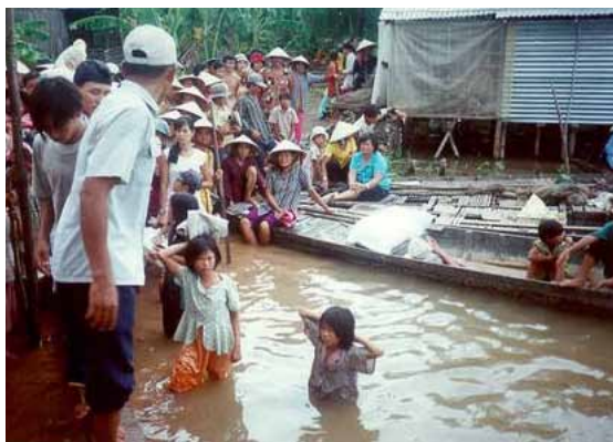
Figure 7. Vietnam is another flood-prone country.

Coastal Alaska is vulnerable to the rise in sea level. 41 Shishmaref, Alaska, is a sparsely populated community on a remote arctic island. The Native