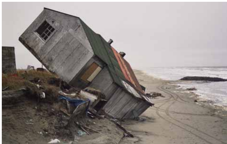
Figure 6. Shishmaref, Alaska, is already experiencing loss of land from storms, as portions of the island are washed into the ocean.