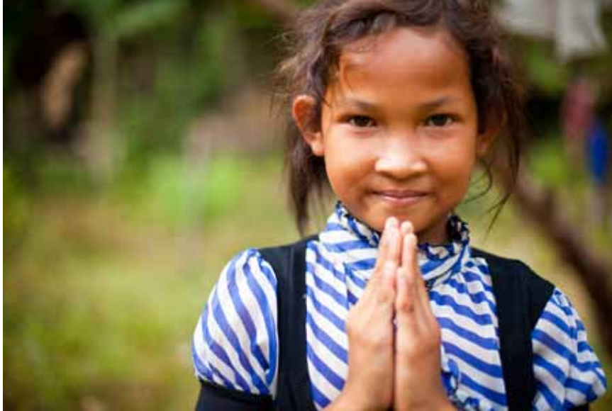
Fig. 15. Girl in Cambodia.

This is not an issue one person can solve, but together, by God's grace, we can make a difference. It would be easy to feel overwhelmed. We could throw up our hands in despair. Our faith, however, encourages us to persist: "Let us not become weary in doing good, for at the proper time we will reap a harvest if we do not give up" (Galatians 6:9).