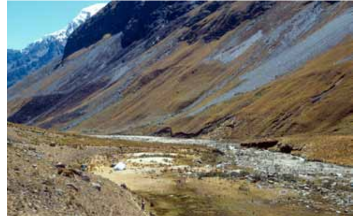
Figure 5. Glaciers in the Andes are drying. Many people must adapt to less predictable water supplies as glacial streams and rivers dry.

Melting will have an impact on wildlife and cause the release of even more greenhouse gases. 31-32 One of the ways it can do this is through positive feedback loops, which occur when a change triggers a series of events that makes the original change even greater. For example, warming of permafrost in the Arctic releases trapped gases from the frozen ground. These, in turn, contribute to a rise in air temperature and greater warming of the ground. 33 There are negative feedback loops as well. An