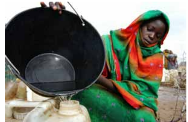
Figure 9. Gathering precious water in Chad. Lake Chad provides water to more than 20 million people living in the four countries that surround it.

could have prevented malnourishment for 20 million people in 2000. 57 However, fisheries are not only stressed by harvest and pollution but also damaged by changes to the climate.