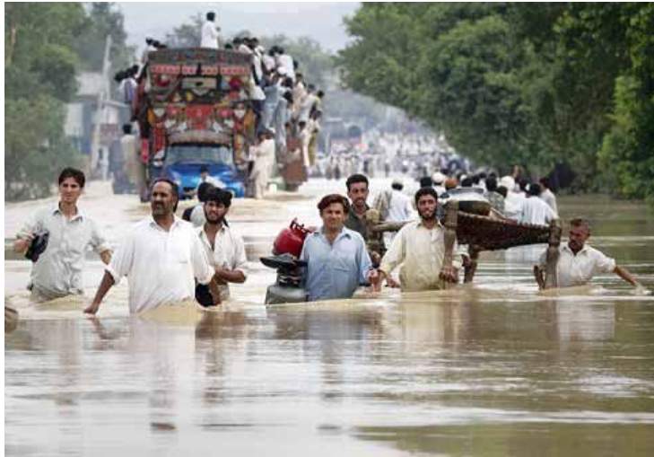
Figure 2. Floods in Pakistan.

On the other side of the world, also during the summer of 2010, a heat wave in Russia killed hundreds of people and triggered dozens of fires that burned for days around Moscow. 2 In Pakistan, floods affected more than 20 million people, damaged or destroyed almost 2 million homes, and devastated Pakistan's infrastructure, from irrigation systems to power plants. 3