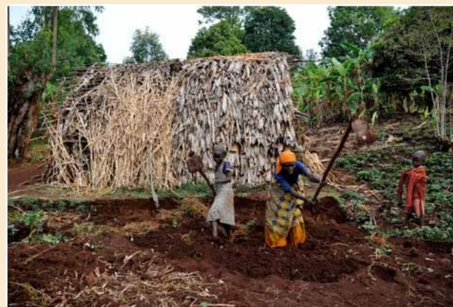
Figure 14. Rural farmer and her children work in the fields.

Climate change is a global phenomenon that affects people everywhere, but it hits the poor hardest. For example, an African farmer who barely ekes out a living with insufficient seeds, tools and other equipment may now be getting more rain, less rain, or the same amount, but in much more intense storms. There may be too much water for planting, too little water to germinate the seeds, rain coming at the wrong time and wiping out the crop. This farmer likely has no crop insurance or government assistance to fall back on, very limited savings, and little or no access to credit. So any weather shock will drive her into deeper poverty, forcing